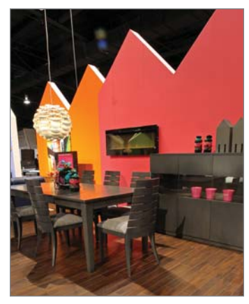
TCHFM Trend Display - Kosmo Collection, 1222 Black Walnut.

Front carpet were a few of the products he used in the vignettes. Designed around Your HomeStyle's four lifestyle movements, D'Anjou and Caron's 2012 Trends Display portrayed Beaulieu Canada's beautiful flooring and exceptional merchandising system as fashionable forecasts for the consumer market this year.