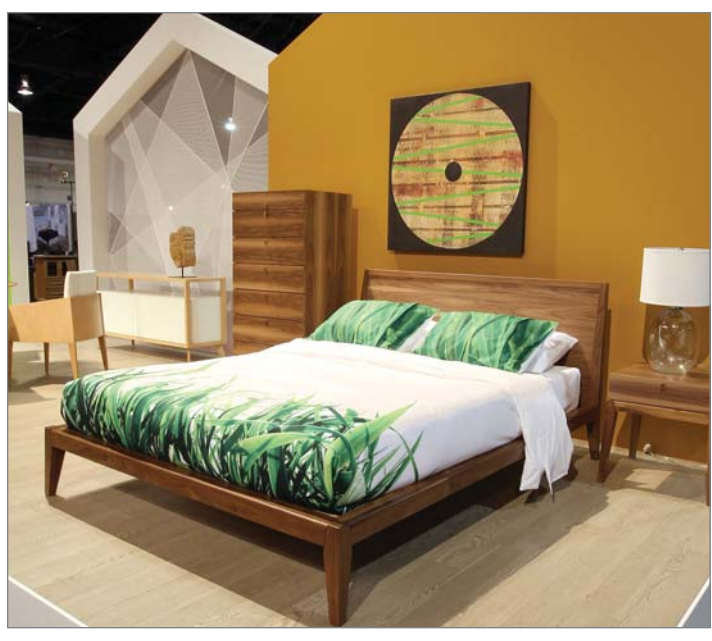
TCHFM Trend Display - Pür Collection, 1244 Berkeley Oak

to renovate the Your HomeStyle image, selected Beaulieu flooring for his display. Beaulieu Canada's Pūr and Kosmo laminate, Karisma resilient and H825 Mystical Lake